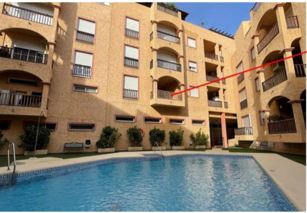
Apartment / apartamento