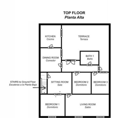
This is a representation of the layout of the property and it is not to scale. Esta es una representación de la distribución de la propiedad y no está a escala.