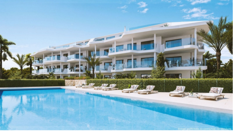
Imagen publicitaria no contractual, no vinculada