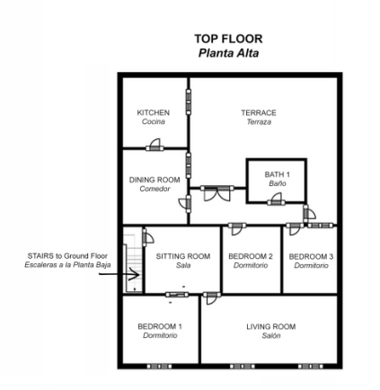
This is a representation of the layout of the property and it is not to scale. Esta es una representación de la distribución de la propiedad y no está a escala