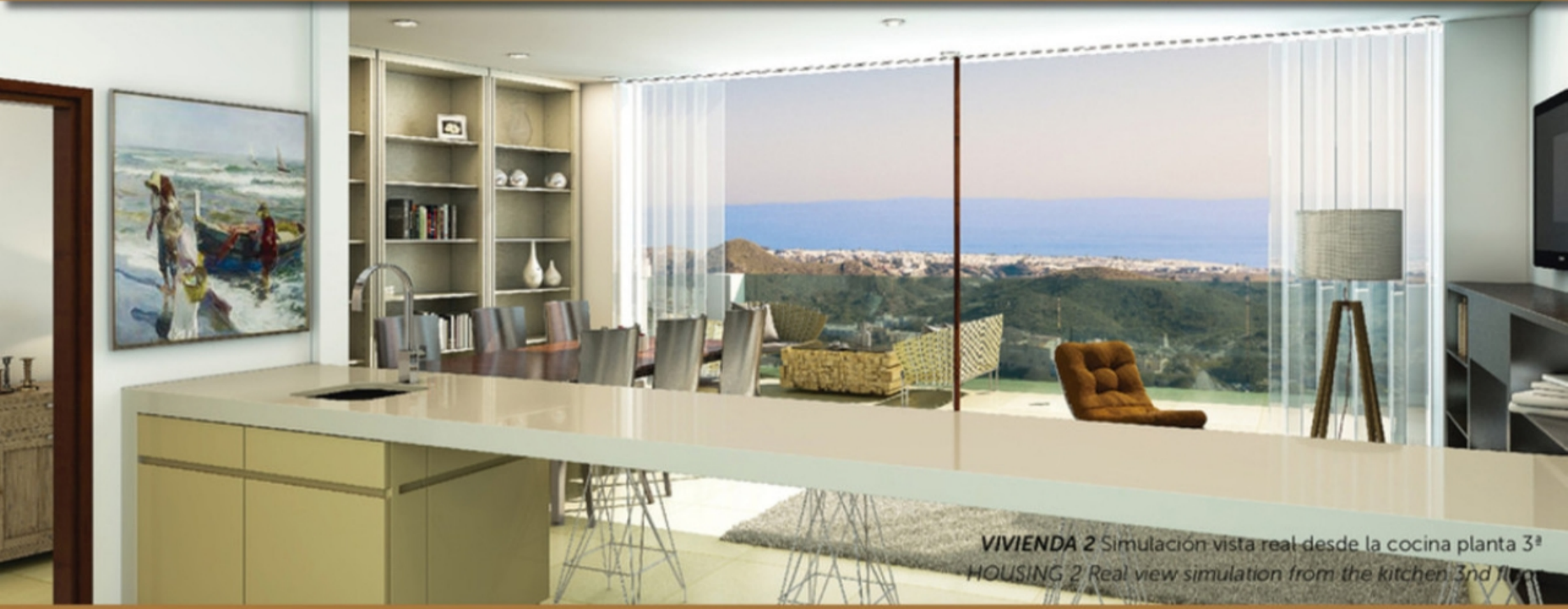
VIVIENDA 2 Simulación vista real desde la cocina planta 3ª HOUSING 2 Real view simulation from the kitchen 3rd floor