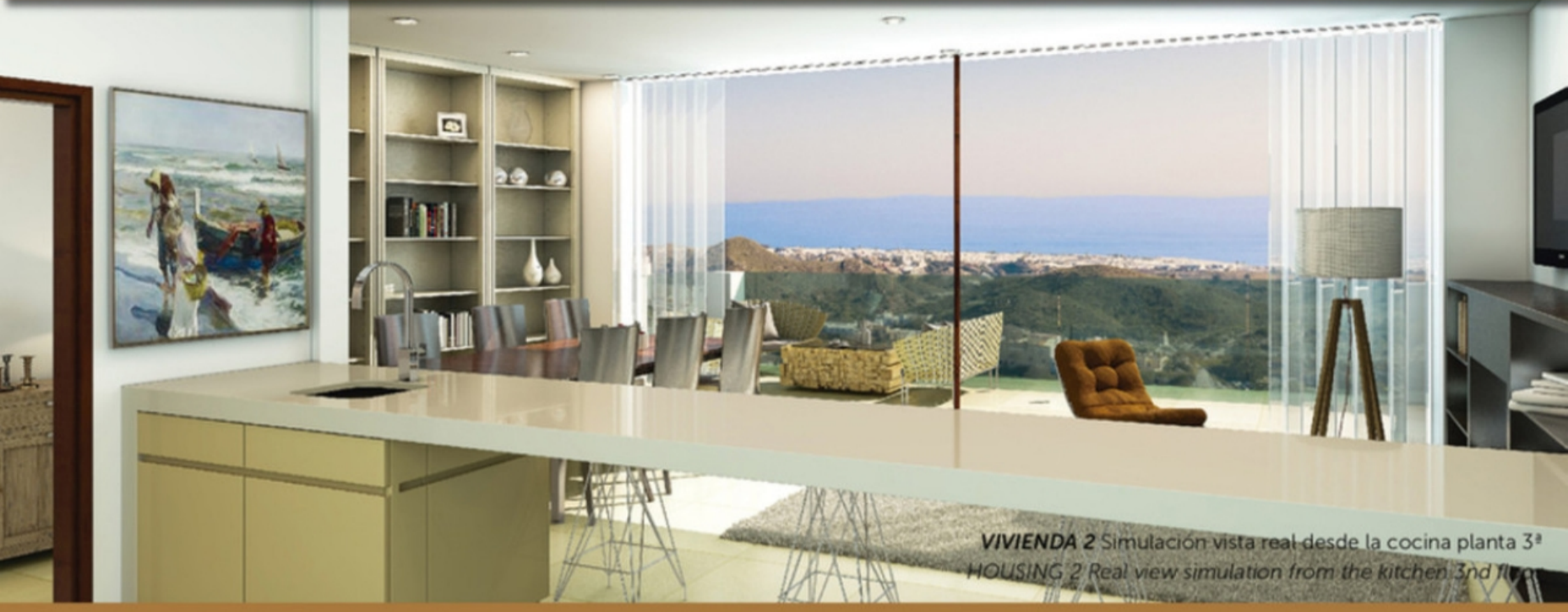
VIVIENDA 2 Simulación vista real desde la cocina planta 3ª HOUSING 2 Real view simulation from the kitchen 3rd floor

- 2 TERRAZAS / TERRACES 16 m 2 y 24 m 2 - TRASTERO / STORAGE ROOM 20 m 2 - PISCINA PRIVADA EN TERRAZA / PRIVATE POOL IN TERRACE