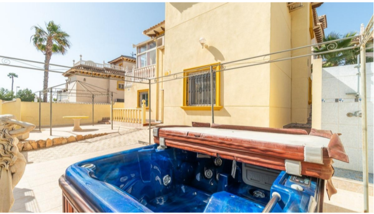
PLAYA LA ZENIA